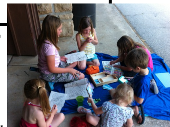
Above: Children playing during the evening service.