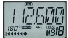
CDI mode display

The IC-A24 has VOR navigation functions. The DVOR mode shows the radial to or from a VOR station and the CDI mode shows the course deviation to/from a VOR station. You can also input your intended radial to/from the VOR station and show the course deviation on the display. In the USA version, the duplex operation allows you to call a COM channel, while you are using VOR navigation. (* IC-A24 only)