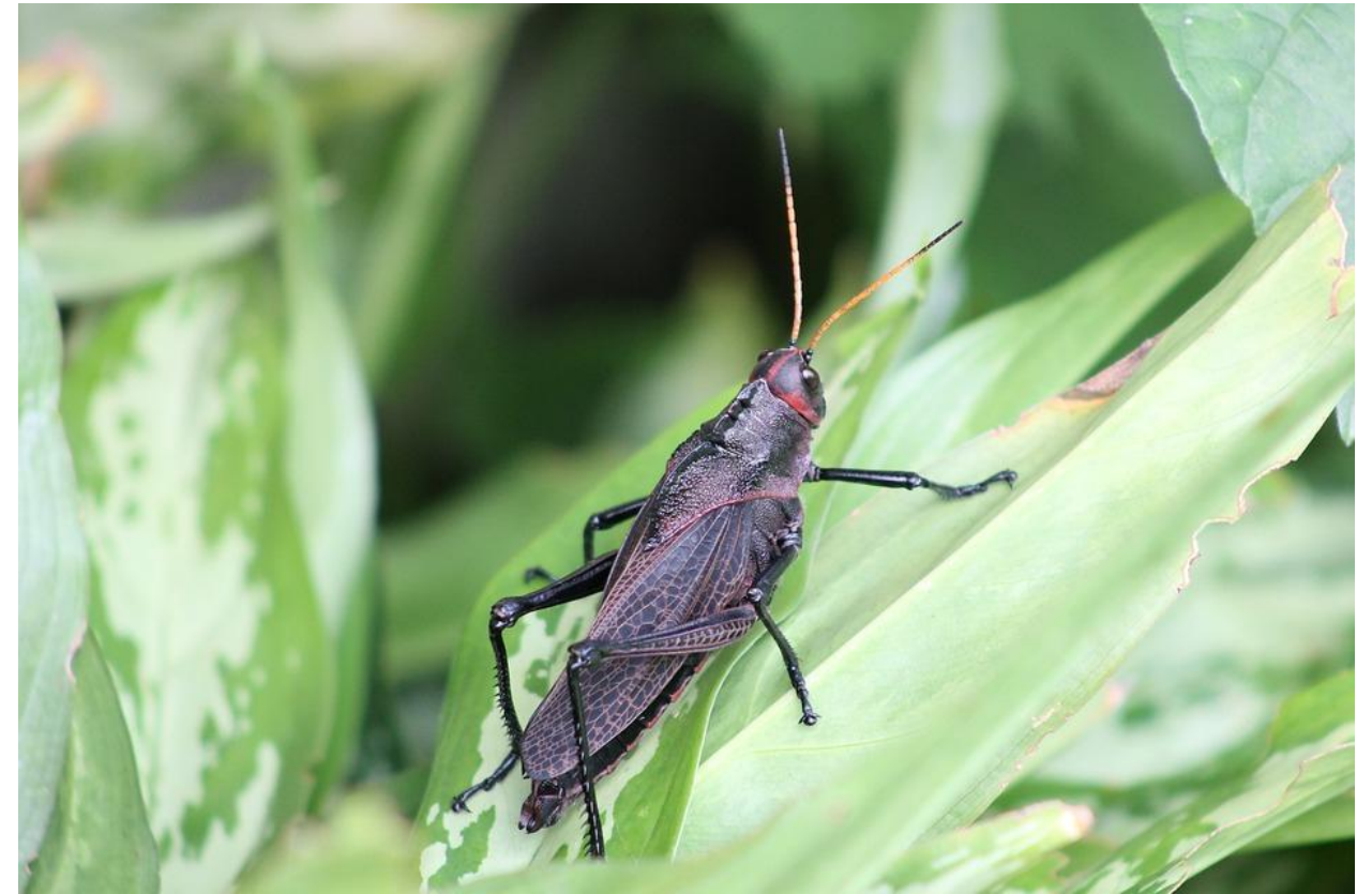
Chuloochuloosh-cricket Nii neemun chuloochuloosh.