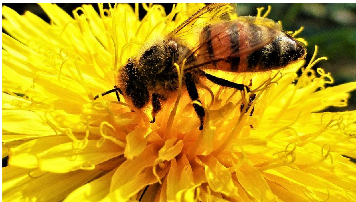
Aamweew-bee Nii neemun aamweew.