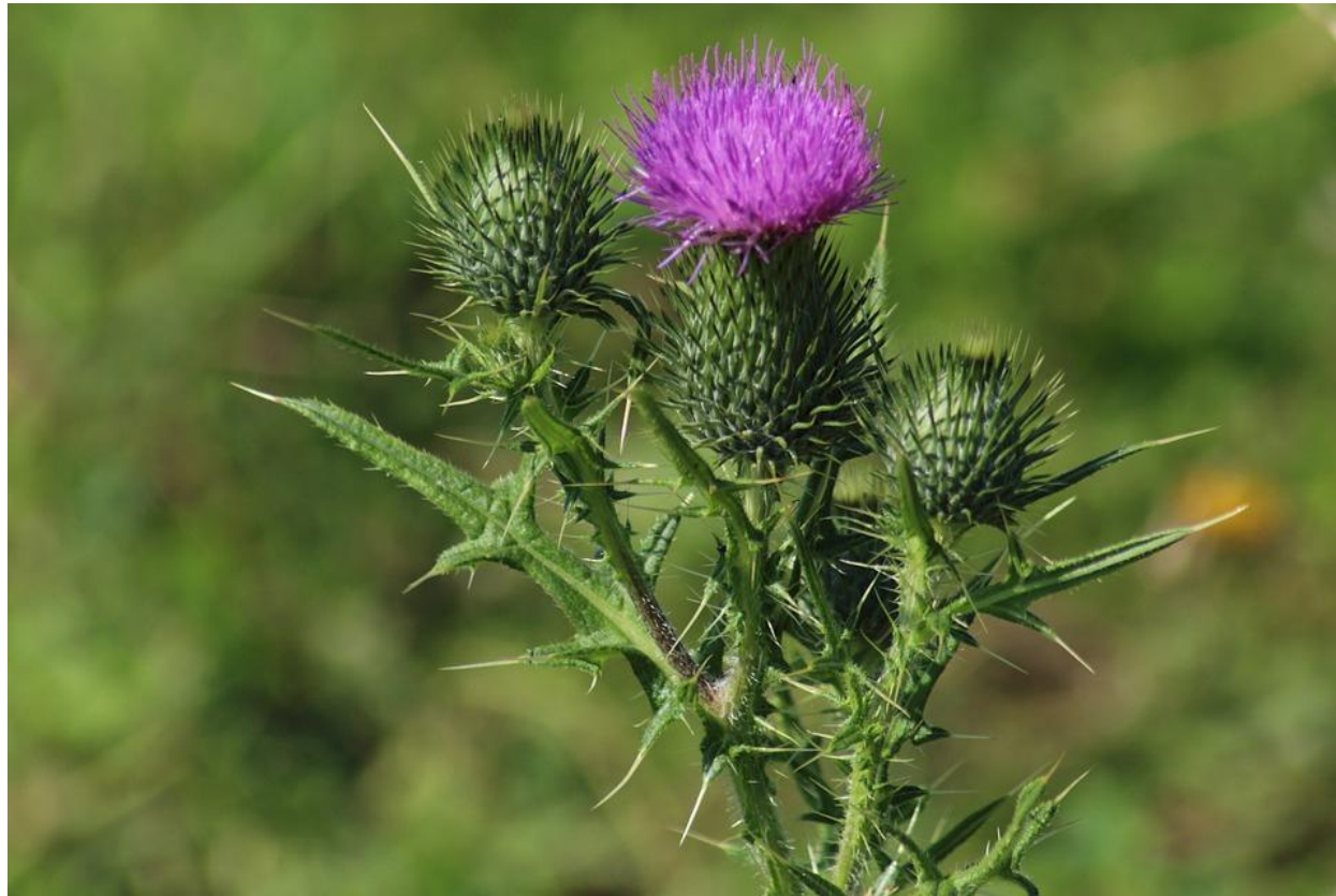
Kaawunzh-thistle Nii neemun kaawunzh.