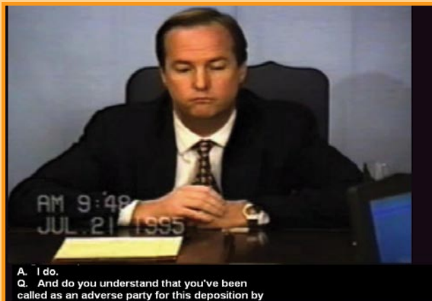
Video Depositions with rolling transcript