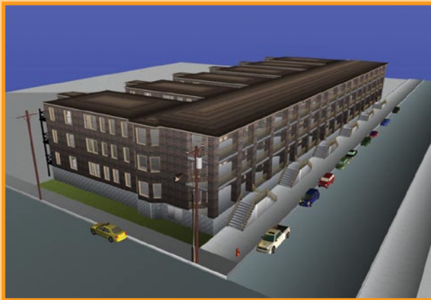
PowerPoint™, 3D Models & Animations