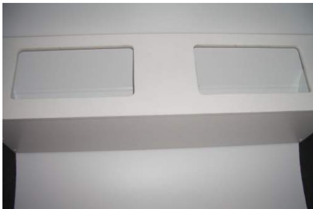
Front Storage Cabinet