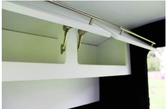
Interior View of Cabinets