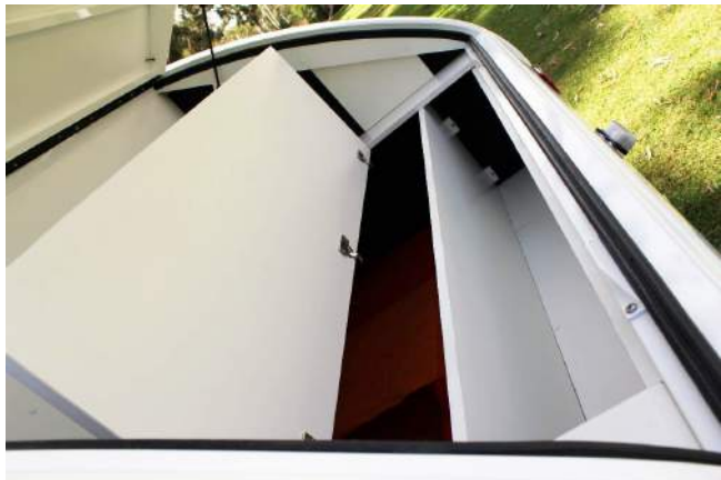
Under Bench Storage