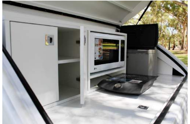
Galley Appliance Cabinet with Fridge