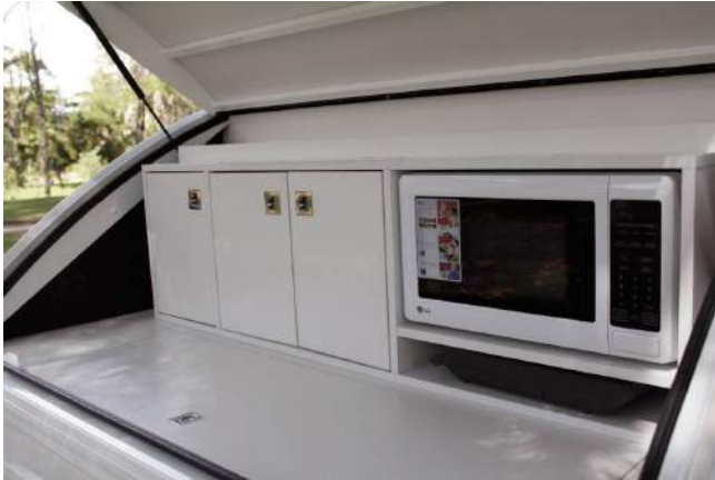
Galley Appliance Cabinet