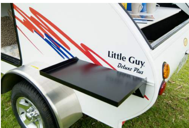
BBQ Bench and Bracket