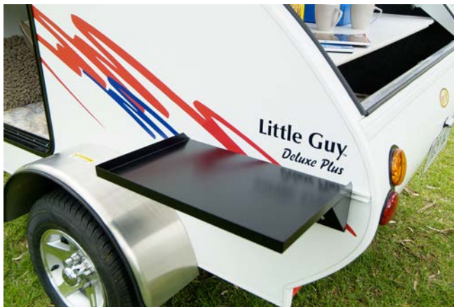
BBQ Bench and Bracket