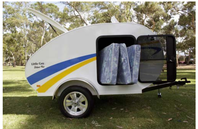
Custom Mattress - Double or Queen