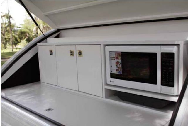
Galley Appliance Cabinet