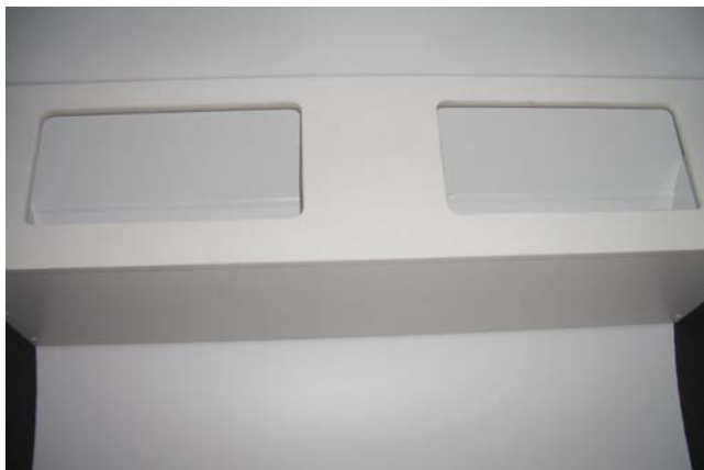
Front Storage Cabinet