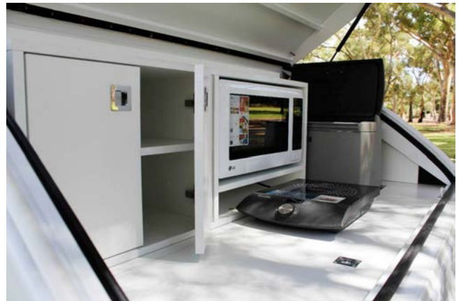
Galley Appliance Cabinet with Fridge