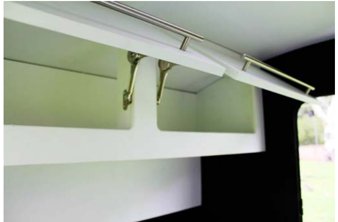
Interior View of Cabinets