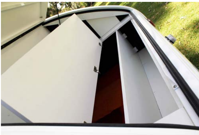
Under Bench Storage