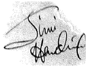
13 14 Defendants' Signature Mark

15 Plaintiffs seek to have Defendants permanently enjoined from using these marks. Plaintiffs 16 reserve for trial their trademark claims regarding Defendants' uses of the marks JIMI 17 HENDRIX and HENDRIX and Defendants' defenses of nominative or fair use, 2 and their 18 claims on damages.