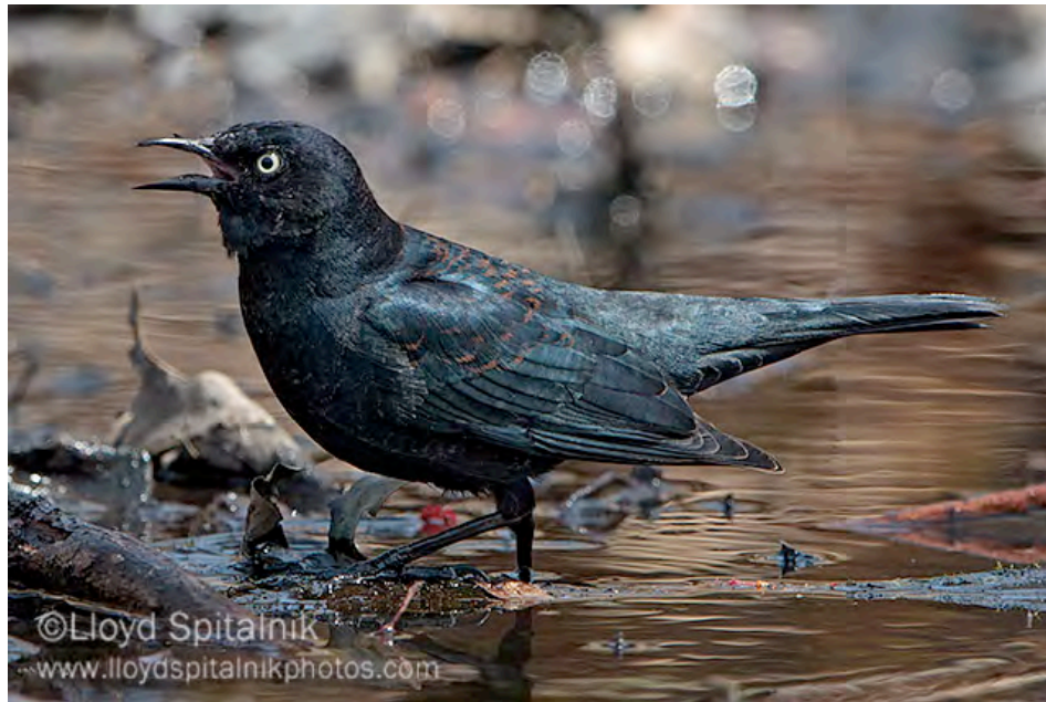
Male Rusty Blackbird in New York City in April. While the rusty tips of the bird’s feathers are still visible, by migration they are quite worn, leaving the males a glossy black.

When we think of Rusty Blackbirds, or “Rusties,” their distinctive rusty-tipped feathers and prominent brown “eyebrows” often come to mind. However, by the time this species migrates northward in the spring, most of the rusty-colored feather edges have worn off the males, leaving them a glossy black. By March, males’ pale brown eye lines have faded as well. The females retain their rusty appearance and eye lines farther into the spring, but by the time females reach the breeding grounds they appear silvery gray or charcoal gray. Both sexes have pale yellow eyes throughout the year, and compared to other blackbirds, the Rusty Blackbird bill is relatively thin.