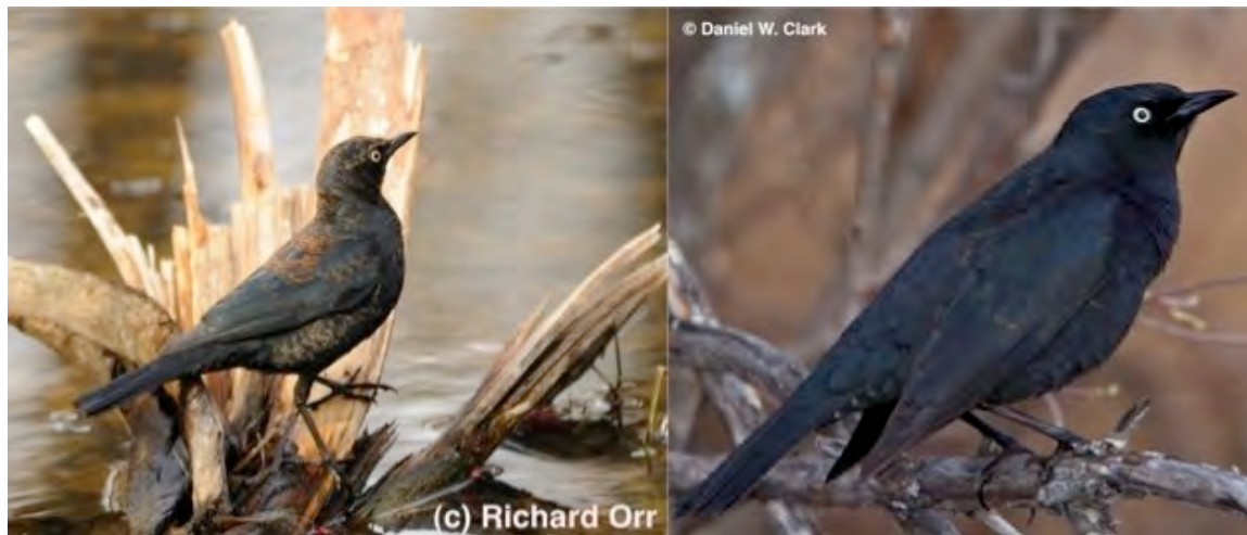
In March (left), male Rusty Blackbirds retain some of their rusty-tipped feather edges. By May (right), males appear glossy black.