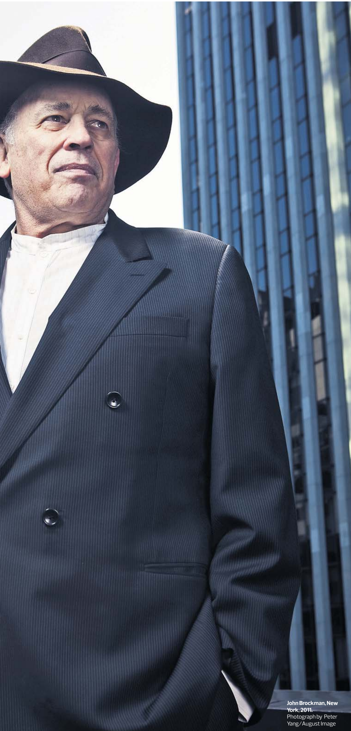
John Brockman, New York, 2011.