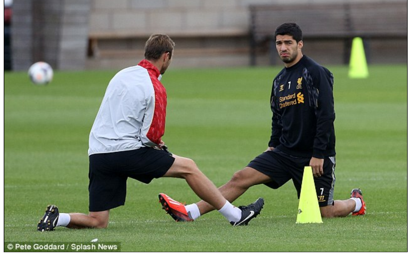
Pete Goddard / Splash News