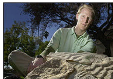
Jellyfish fossils are seen at the left center edge and top right