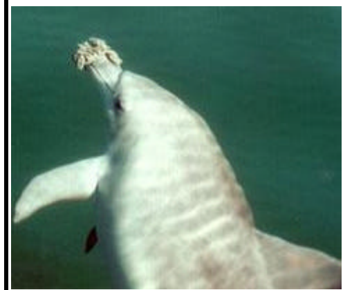
Demi, a female dolphin, exhibits sponge-carrying behavior

“A behavioral trait is considered to vary culturally if it is acquired through social learning” and is “transmitted repeatedly within or between generations,” the researchers wrote. “Bottlenose dolphins are highly imitative and capable of social learning, both in the wild and in captivity.”