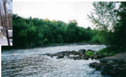
Grandfather Falls Recreation Area