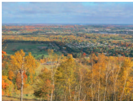
The spectacular view from Rib Mountain.