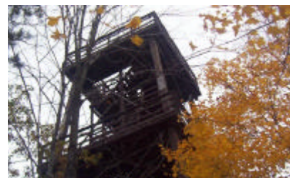
The observation tower at Rib Mountain.