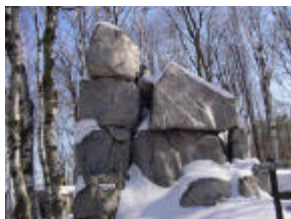
Rock formation at Rib Mountain State Park