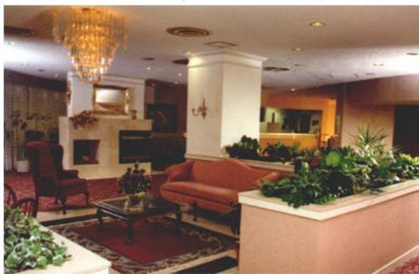
The Lobby at the Plaza Hotel