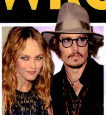
VANESSA PARADIS AND DEPP