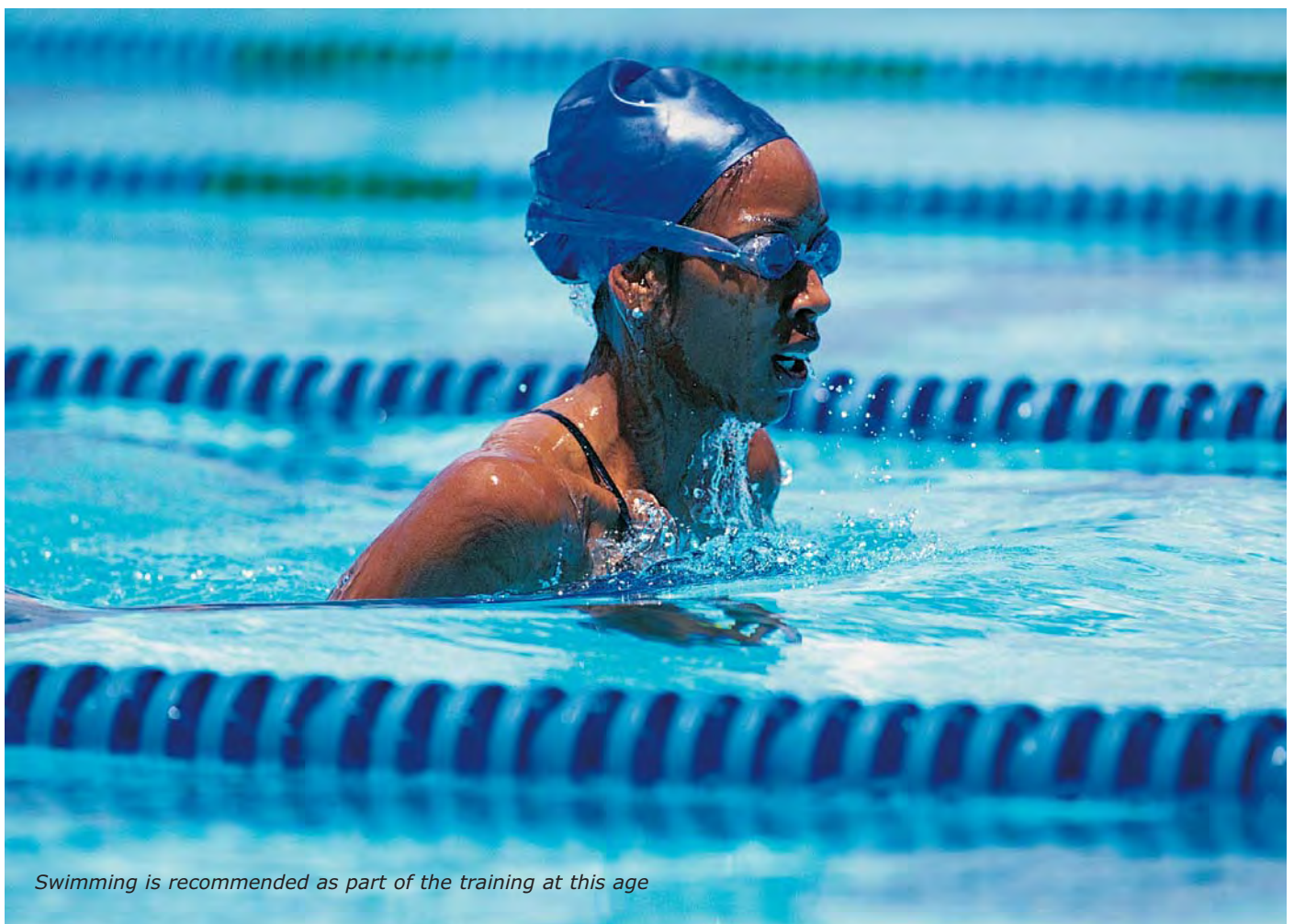
Swimming is recommended as part of the training at this age

Many parents, teachers, gym and health club staff and physicians mistakenly believe resistance training, and in particular the sports of weightlifting and powerlifting are dangerous activities, particularly for children. 43 In this context it is quite common to find resistance training and weightlifting facilities highly restricted for children and many adolescents (often restricted up to age 16-18 yrs) in North America, Great Britain and much of Europe. Within the last 10 years the authors have had many discussions/presentations, with parents, coaches, teachers, physicians etc. concerning the efficacy and safety of resistance training and in particular weightlifting. These discussions have been both in formal settings, 64-67,77, 86,87 as well as informal settings. To better understand how this controversy has arisen a brief history of the medical/scientific efforts to address resistance training including resistance training for sport is necessary. In 1983, the American Academy of Pediatrics 3 produced a position statement that has had serious negative impact for more than two decades. Much of the reasoning behind this position stand was based on injuries to the epiphysis 39,42 and musculo-skeletal system maturity. The position paper concluded that resistance training should be used with