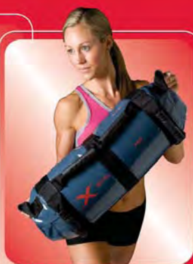
X.Bag – the ultimate sports specific training tool 2.5- 30kg