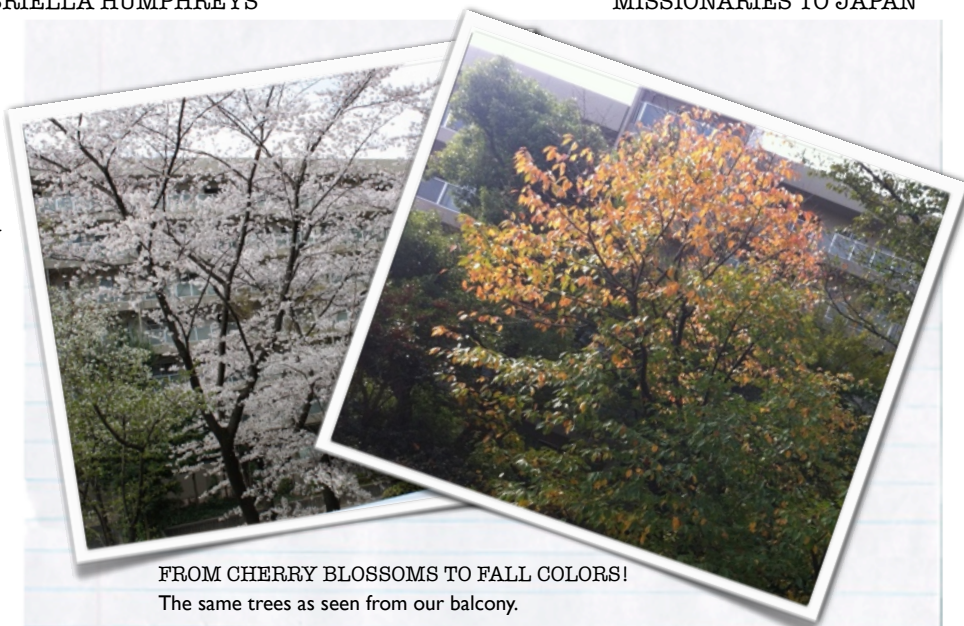
FROM CHERRY BLOSSOMS TO FALL COLORS! The same trees as seen from our balcony.

This sad philosophy is only encouraged by the Shinto and Buddhist beliefs that they hold to. They have no comprehension of the eternal nature of humans and they sadly do not know that life is not merely a brief flash-in-the-pan but is instead meant to be an eternity of joy and worship in Christ. (cont. on page2)