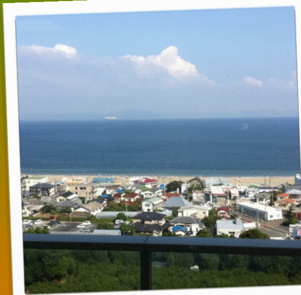
A view from our hotel room at the retreat.

This year I (Alex) attended the Tokyo district pastors retreat alone. I shared a room with 5 other Japanese pastors. We had a great time getting to know each other and learning in the retreat sessions. When not in sessions we ate delicious food and took relaxing "hot springs baths"... together... naked. (Don't worry men and women are separated)