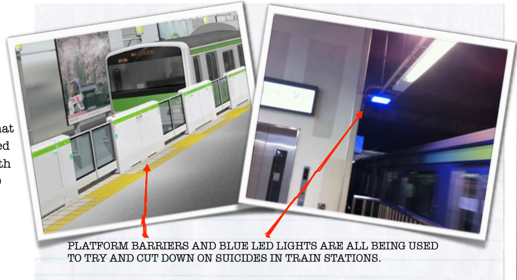
PLATFORM BARRIERS AND BLUE LED LIGHTS ARE ALL BEING USED TO TRY AND CUT DOWN ON SUICIDES IN TRAIN STATIONS.

In 2010 the Japanese government allocated the equivalent of $133 million to help aide suicide prevention efforts. One common method of suicide in big cities, especially Tokyo, is jumping in front of commuter trains. Japan Rail (JR) is constantly battling the issue and recently reported that train suicides rose from 42 in 2006 to 58 in 2007 and 68 in 2008. This may seem like an insignificant number but it works out to a suicide every five days. These suicides cause major disturbances to the vital train and subway system in Japan, affecting tens of thousands of commuters (including myself). Because of the integrated nature of the rail system