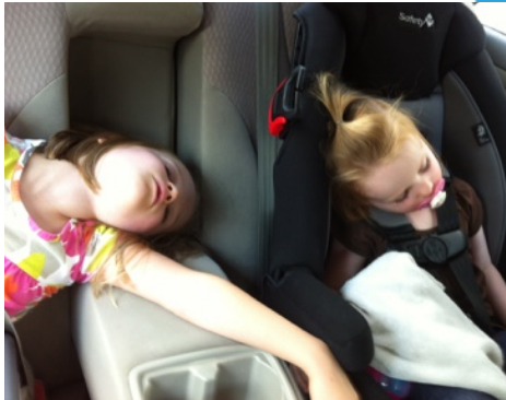
The girls do great in the car...and catch up on their sleep too!

We thank the Lord for His grace and protection thus far.