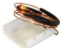
F1-2600 plate c/w 12' of tubing

RT4 Freezer box 10.5 (267mm) long x 12.5 (317) high x 6.5 (165mm) wide