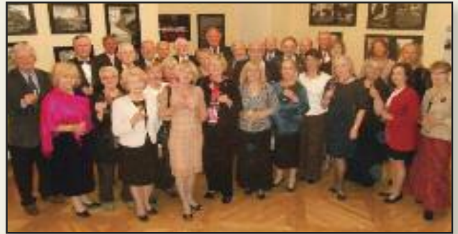
Global Estonians at the Estonian World Council reception in Tallinn

The Estonian World Council is the global organization uniting Estonians throughout the world. The central organizations that belong to EWC are from Canada, USA, Sweden, Finland, Russia, Germany, Latvia, Lithuania, Czech Republic, Australia, United Kingdom and Ukraine. The EWC was registered in 1982 as a non-profit organization to help preserve and promote Estonian culture and language, but its beginnings go back to the 1950's, when widely-scattered Estonian diaspora organizations sought to maintain and strengthen their ties with each other. Laas Leivat in Canada is the current president of EWC. EANC, as one of the largest members, is entitled to six representatives. The Estonian World Council's primary functions are to: