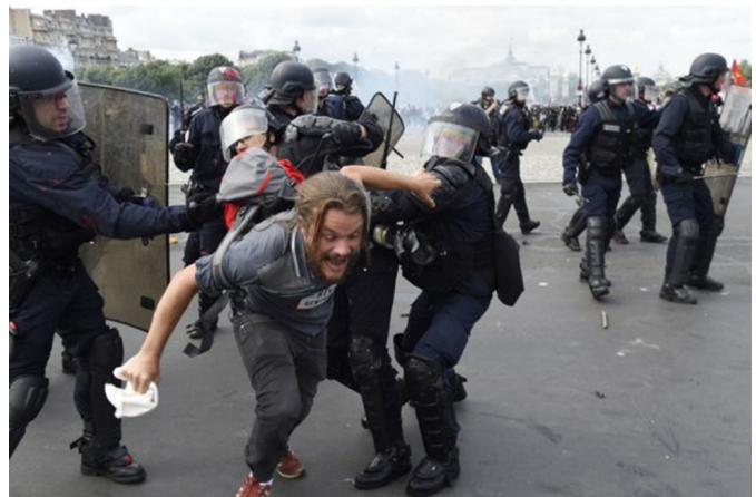
Image caption Violence erupted during the left-wing demonstration in central Paris on 14 June