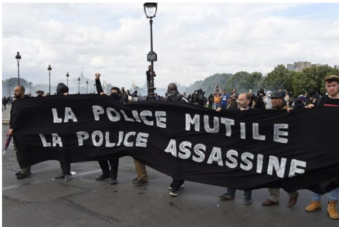
Image caption "The police mutilate, the police murder," said a banner at a Paris protest against labour market reforms

But in addition to physical exhaustion and the stress caused by fear, many policemen and women are exasperated by the conditions under which they work, and the abuse which they say is increasingly directed at them.