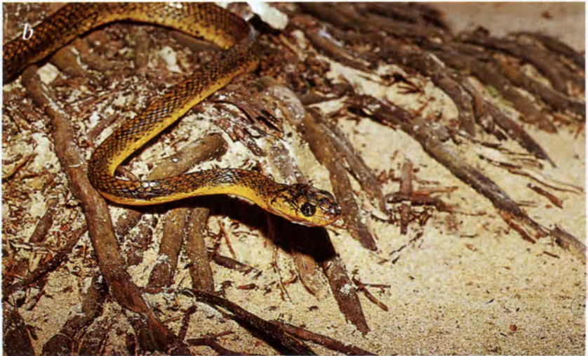
Figure 1 (a and b). Holotype of Boiga wallachi (ZSI 25133) in life.