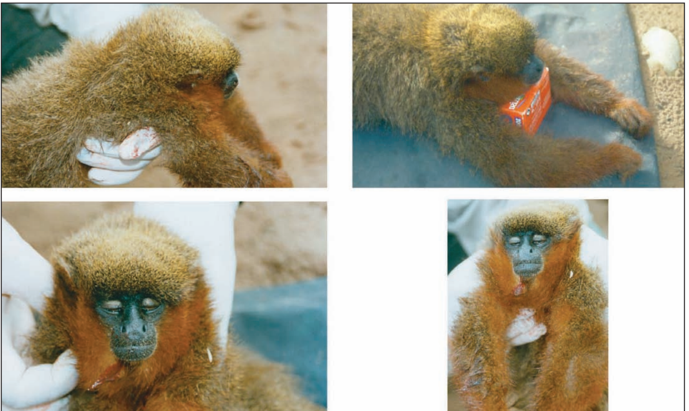
Figure 4. C. aureipalatii , new species. Views of the male holotype (CBF7511).