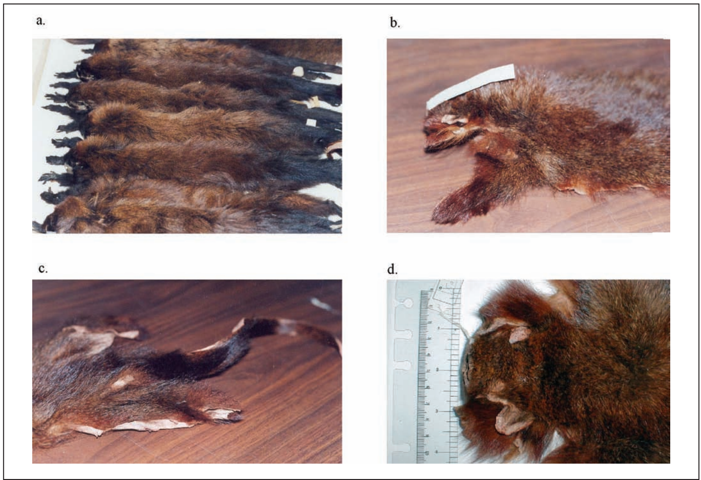
Figure 9. Specimens examined at the American Museum of Natural History; a. Callicebus brunneus series from Brazil; b., c., d., dorsal views of specimen (AMNH262650) collected in Chive, Madre de Dios, Bolivia.

AMNH it is classified as C. brunneus despite being markedly different from the main C. brunneus series collected in Brazil. Although the specimen displays some broad similarities with C. aureipalatii , for example, the rufous coloration on the limbs and general body coloration, neither the orange throat coloration nor golden crown are evident (Fig. 9). In short, further research is required to determine the taxonomic status of Callicebus populations in Pando Department, Bolivia.