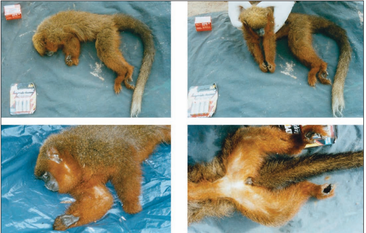
Figure 3. C. aureipalatii , new species. Views of the male holotype (CBF7511).