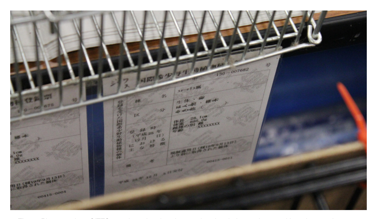
Fig. 1. Photograph of CITES permit stating that the specific slow loris was imported into Japan prior to 13 September 2007 as recorded during the in-store pet shop investigations in Tokyo, Japan between 8 May and 1 July 2014. The slow loris in question was too young to have been imported at this time, showing the falsification of the document. Photograph source: principal investigator.

Note: (1) recorded in two in-store pet shops in Tokyo and 18 online pet shops across Japan; and (2) observed in 93 Japanese online videos from three Web 2.0 sites, during investigations between 8 May and 1 July 2014.