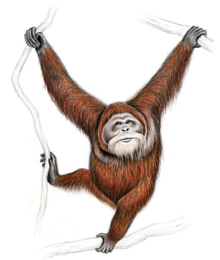
Sumatran Orangutan ( Pongo abelii )

The IUCN/SSC Ape Populations, Environments and Surveys (A.P.E.S.) database is a joint initiative of the Max Planck Institute for Evolutionary Anthropology and the SGA. A.P.E.S. is a repository for survey data on great apes; a place to store information for monitoring populations and distributions that allows for the analysis of population trends and for well-informed priority-setting, hypothesis testing, and policy advice. The database is the foundation of the A.P.E.S. Portal, where information on species status, data availability and survey data gaps, geographic range, occurrence probability, threat and trends in occurrence is available and will be regularly updated. See: http://apesportal.eva.mpg.de/