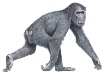
Central chimpanzee ( Pan troglodytes troglodytes )

International Union for Conservation of Nature (IUCN) is the world's oldest and largest global environmental organization, bringing together States, government agencies and a diverse range of NGOs in a unique world partnership which seeks to assist societies throughout the world to conserve the diversity of nature and to ensure that any use of natural resources is equitable and ecologically sustainable. IUCN has six Commissions, of which the Species Survival Commission (SSC) is the biggest. This network of volunteer scientists advises IUCN on the technical aspects of species conservation. Most SSC members are deployed in Specialist Groups focused on over 120 distinct species or species groups. The Primate Specialist Group (PSG) is concerned with more than 680 species and subspecies of monkeys, apes and lemurs, carrying out conservation status assessments and making recommendations on taxonomic decisions, which inform IUCN policy as a whole. The PSG produces a number of journals and newsletters, including Primate Conservation , African Primates , Asian Primates Journal , Lemur News and Neotropical Primates . The Great Ape Section of the PSG focuses exclusively on issues affecting the 13 taxa of bonobos, chimpanzees, gorillas and orangutans.