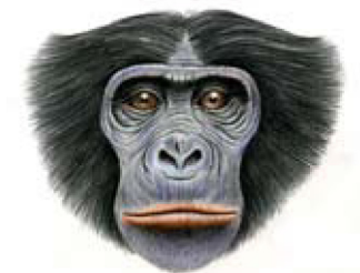
Bonobo ( Pan paniscus )