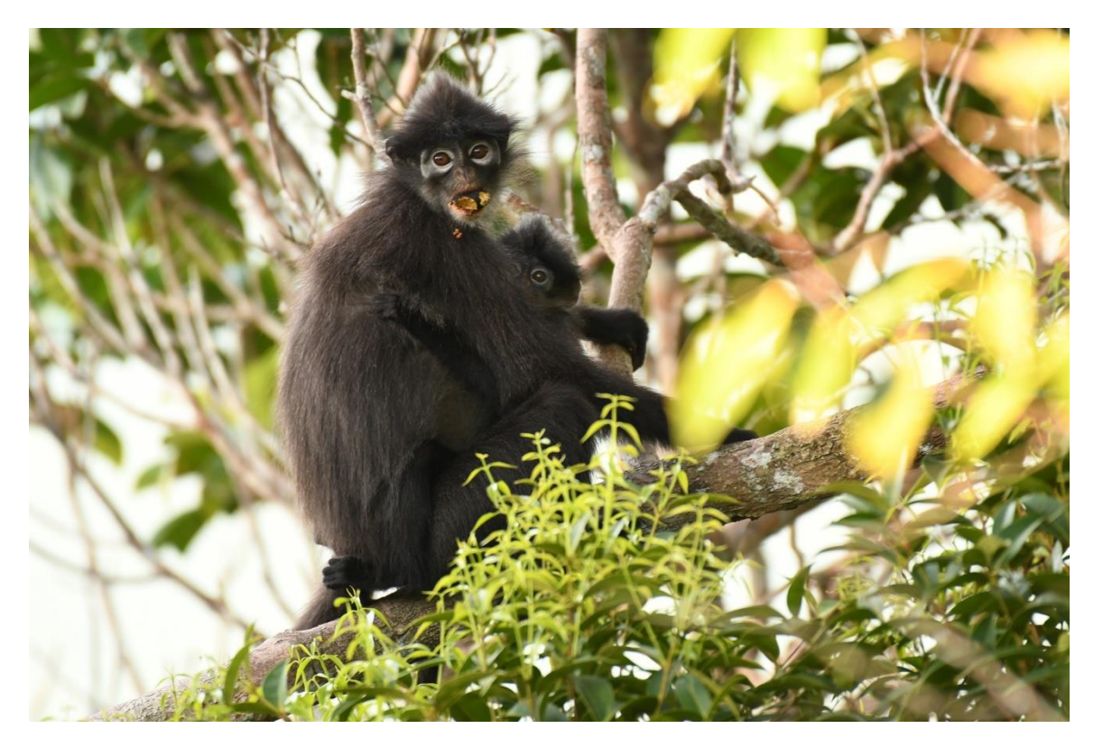
Figure 3. An adult Raffles' banded langur feeding on fruit.