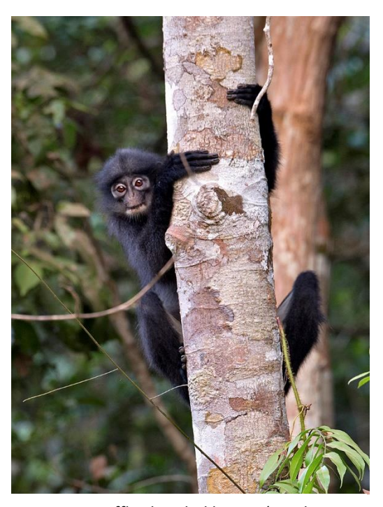
Figure 1. Raffles banded langur ( Presbytis femoralis femoralis ) in Johor.

The banded langur is found in the Malay Peninsula and Sumatra (Groves 2001) and three subspecies are currently recognised: Raffles' banded langur ( Presbytis f. femoralis ) in Johor and Pahang states, Malaysia and in Singapore (Fig. 1); East Sumatran banded langur ( P. f. percura ) in eastern Sumatra; and Robinson's banded langur ( P. f. robinsoni ) in northwest Malay Peninsula, extending north throughout peninsular Thailand and Myanmar (Fig. 2).