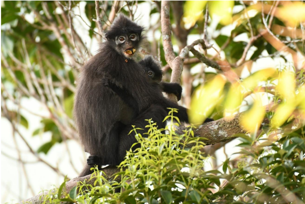
Figure 3. An adult Raffles' banded langur feeding on fruit.