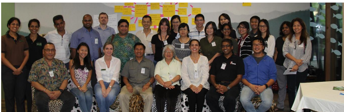
Figure 4. Participants at the strategy workshop held at the Singapore Zoo on 1-2 August 2016.

Finally, participants re-convened to finalise the Vision and Goals, to discuss next steps and to agree an editing team to oversee development of the report.