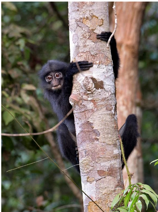
Figure 1. Raffles banded langur ( Presbytis femoralis femoralis ) in Johor.

The banded langur is found in the Malay Peninsula and Sumatra (Groves 2001) and three subspecies are currently recognised: Raffles' banded langur ( Presbytis f. femoralis ) in Johor and Pahang states, Malaysia and in Singapore (Fig. 1); East Sumatran banded langur ( P. f. percursa ) in eastern Sumatra; and Robinson's banded langur ( P. f. robinsoni ) in northwest Malay Peninsula, extending north throughout peninsular Thailand and Myanmar (Fig. 2).