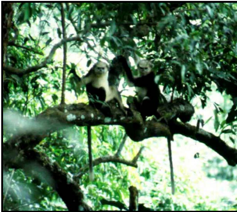
Adult females