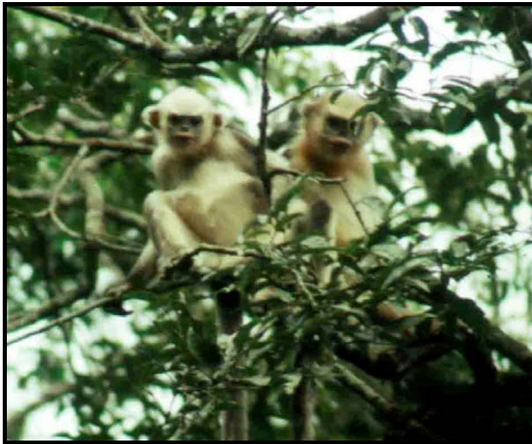
Young juveniles © Ramesh Boonratana