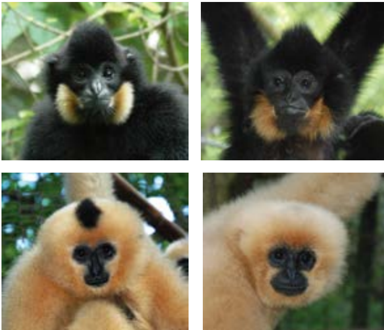
Fig.1. Left: Southern yellow-cheeked gibbon ( Nomascus gabriellae ); Right: Northern yellow-cheeked gibbon ( Nomascus annamensis ) – males above, females below. The coloration of these species is very similar and the species is not identified in the field.

The northern yellow-cheeked gibbon (Fig. 1) was described as a new species (Van Ngoc Thinh et al. 2010a). Although N. annamensis is similar to the southern yellow-cheeked gibbon ( N. gabriellae ) in external appearance, both species clearly differ in their vocalisation and mitochondrial DNA (Konrad & Geissmann 2006; Rawson et al. 2011; Van Ngoc Thinh 2010; Van Ngoc Thinh et al. 2010a; 2010b; 2010c; 2011). Although the general distribution of N. annamensis in southern Laos, North Cambodia and Central Vietnam is well known, detailed information about the exact distribution range and occurrence in protected areas, as well as estimates of population sizes are lacking.