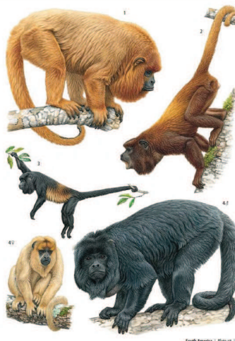
Howler Monkeys. Illustration by Francois Desbordes.