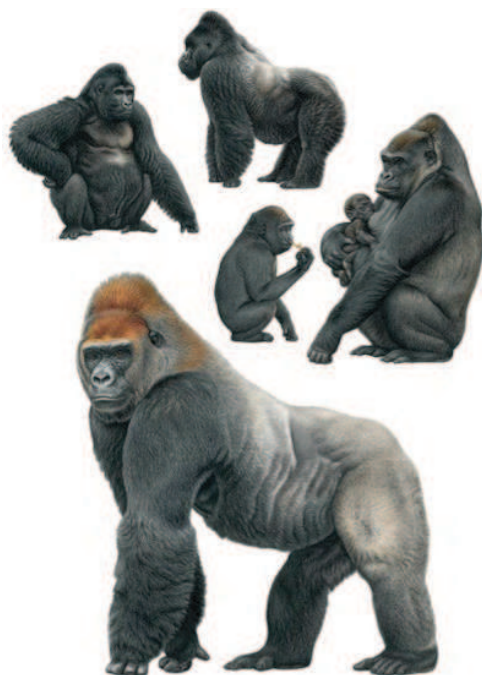
Gorillas. Illustration by Francois Desbordes.

Moreover, despite the shortcomings, it can still serve as a beautiful, yet reasonably priced, resource on the Order Primates even to undergraduates and graduates, and definitely a must-have for all those who appreciate the diversity of primates and beauty of the natural world.