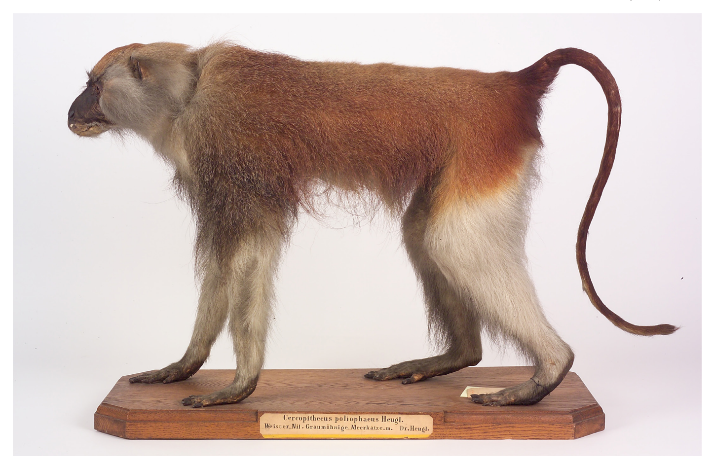
Figure 5. Lectotype of Erythrocebus poliophaeus (Reichenbach, 1862) in the Vienna Natural History Museum.

Gubba (11°15'N, 35°17'E). The data and photographs of Yirga et al. (2010) are critical to assessing the southern limit of E. poliophaeus in Bambesi Woreda (Benshangul Gumuz State), well south of the Blue Nile at 9°48.5'N, 34°42.6'E and at 9°53.76'N, 34°40.27'E. As patas monkeys tend to be low-land dwellers, up to 1000 m above sea level (Assosa/Bambesi has an altitude of 1400–1600 m asl), it is postulated that there is an altitude barrier between Erythrocebus poliophaeus in Benishangul and the Gambela Erythrocebus taxon, as, in the Oromiya region along the Sudanese border, between Benishangul and Gambela, the Ethiopian highlands stretch up to the Sudanese border reaching higher elevations (Fig. 6).