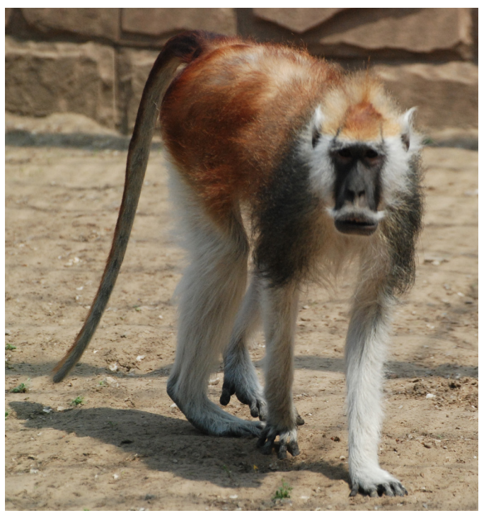
Figure 3. Adult male Erythrocebus poliophaeus , Beijing Zoo.

monkeys, which certainly belong to a different species. The skull of the holotype of albigenus is quite distinctive according to Elliot (1913), but this obviously requires the study of much more material.