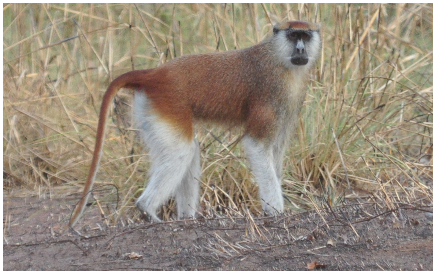
Figure 2. The typical patas monkeys from Gambela National Park, provisionally referable to Erythrocebus pyrrhonotus formosus Elliot, 1909.

Although poliophaeus is de facto unstudied in its natural range, the observations of Loy (1974) regarding changes in color of the faces in female Erythrocebus from Ethiopia must be referred to this taxon (and certainly not to E. patas sensu strictu , as supposed by Isbell 2013), as confirmed by Loy's remark that "our Ethiopian adult males are problematical with their black noses" (Loy 1974: 255). This can be further confirmed by comparing photos of adult females in Loy (1974: plate 1) with those from Nigeria in the study of Palmer et al. (1981: 375), which found ontogenetic changes in nose color but never observed dark facial skin in their patas