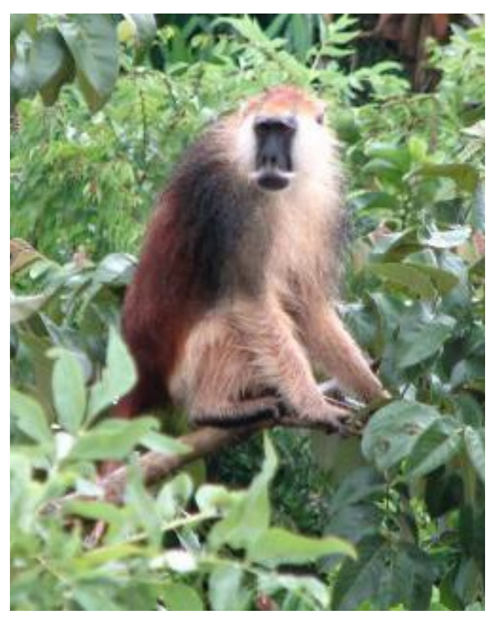
Figure 1. Erythrocebus poliophaeus (Reichenbach, 1862) from western Ethiopia (from Yirga et al. 2010).

elsewhere in East Africa and even in southwest Ethiopia (Fig. 2). A photo of an adult male near the Alatish National Park, not far from the village of Gelego (12°13'N, 35°53'E) (Heckel et al. 2007), perfectly agrees with the above, and both have the characters described for poliophaeus Reichenbach, 1862 (Fig. 3), of which albigenus Elliot, 1909, is certainly a junior synonym. In his description of albigenus (one adult captive male, type locality unknown but "somewhere in Sudan"), Elliot remarked that the face and nose were black, lacking a band between ear and eye, and the shoulder covered with very long black hairs annulated with cream color; he remarked also on the very long, mane-like hair on the hind neck and shoulders (Elliot 1909, 1913). The photos from Yirga et al. (2010) also show the species in an atypical habitat for the genus (close to bamboo forest). We might postulate that this species survived an arid period in a montane refugium in western Ethiopia.