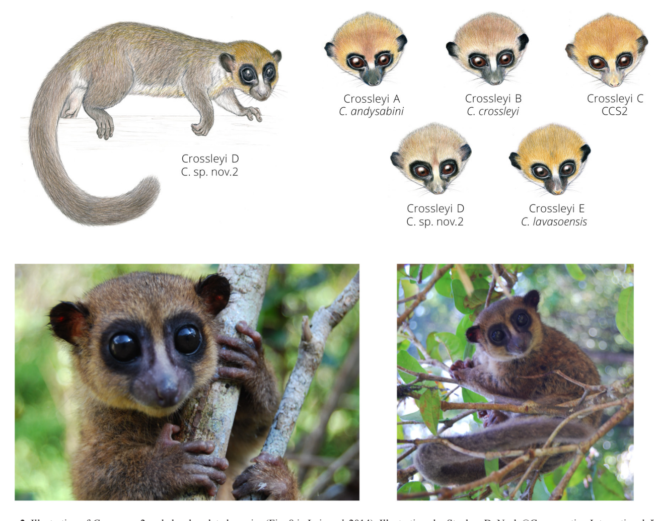
Figure 2. Illustration of C. sp. nov. 2 and closely related species (Fig. 8 in Lei et al. 2014), Illustrations by Stephen D. Nash ©Conservation International. Photographs by Edward E. Louis, Jr. Top left panel represents C. grovesi . Top left panel represents a lateral view of C. sp nov. 2, top right panel includes all lineages in the Cheirogaleus crossleyi group. Bottom photographs are of the holotype of C. sp. nov. 2 (TRA8.81) at Andringitra National Park.