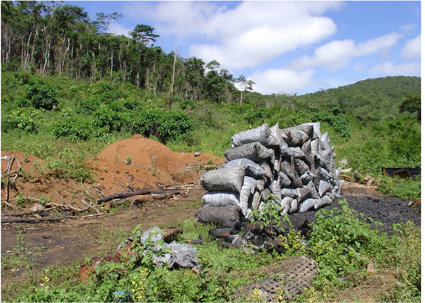
Charcoal being produced with native species of the Atlantic Forest. Fazenda Araras, Ladainha, Minas Gerais.