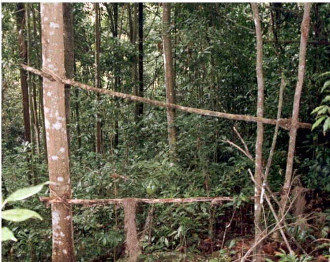
"Poleiros de espera" or "girais" used for hunting mammals. Fazenda Bom Jardim, Itarantim, Bahia.