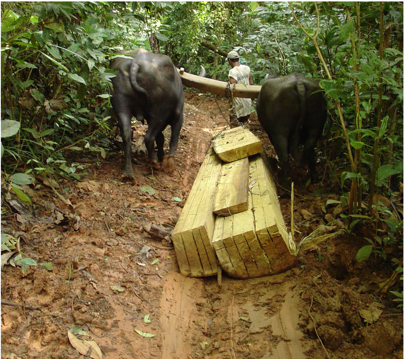
Illegal removal of timber using buffalos. Fazenda Serra Azul, Bandeira, Minas Gerais.