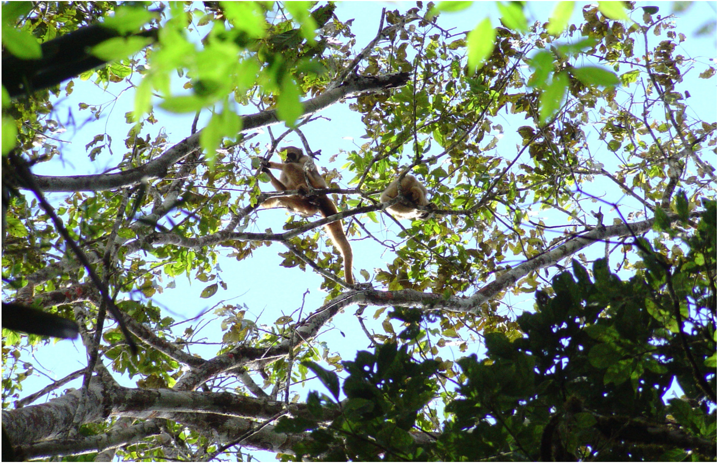
Adult female and infant of the northern muriqui, Brachyteles hypoxanthus. Fazenda Duas Barras, Santa Maria do Salto, Minas Gerais.