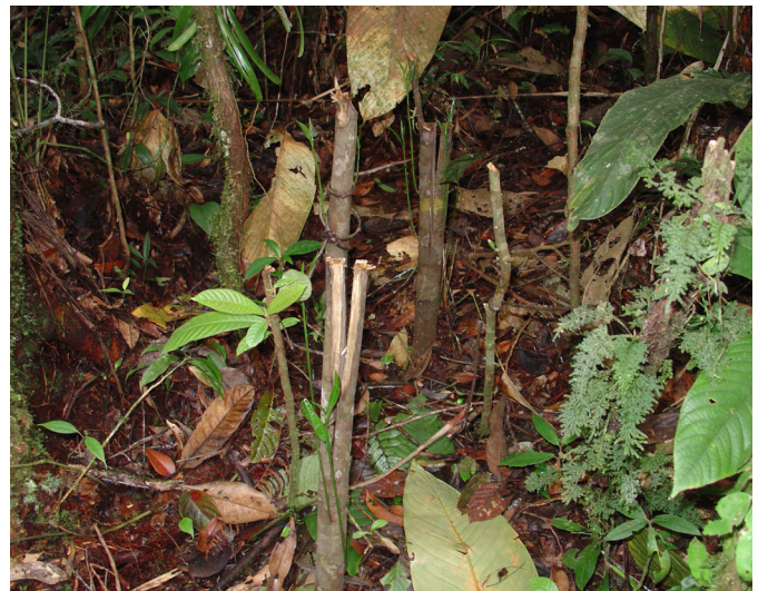
Wooden stake used to secure a trap, known locally as "canhão" or "trabuco," for hunting mammals. Fazenda Duas Barras, Santa Maria do Salto, Minas Gerais.