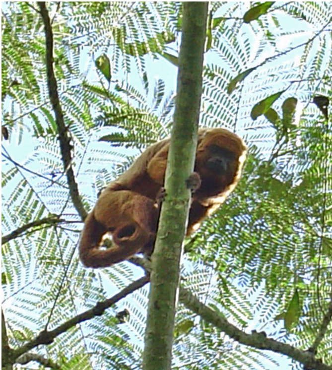
Adult male brown howler, Alouatta guariba clamitans. Fazenda Araras, Ladainha, Teófilo Otoni, Minas Gerais.