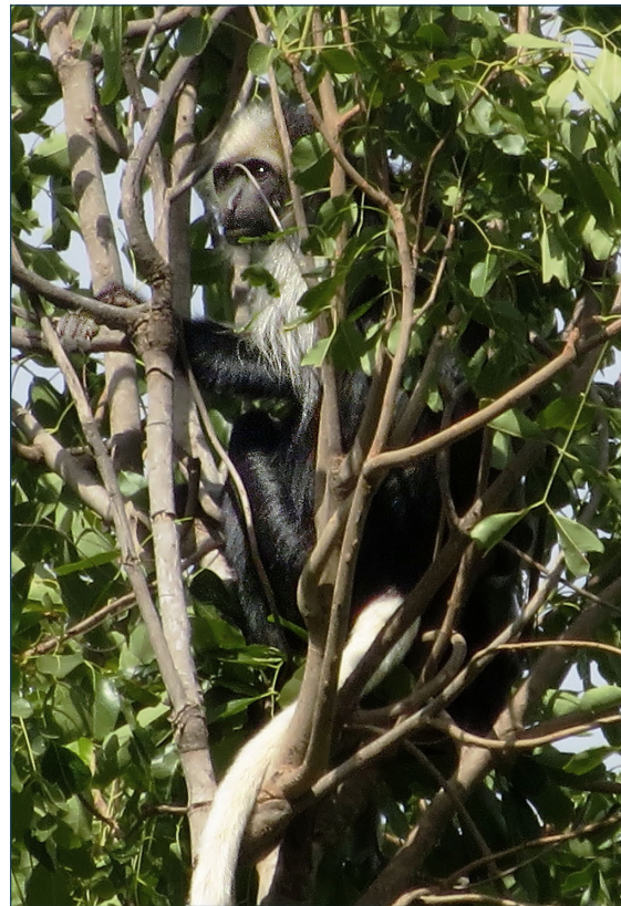
Figure 4. King Colobus Colobus polykomos in Sabé (Guinea).

Inquiries in villages of the Lebekere subprefecture suggested the presence of C. polykomos in seven localities, including our field study area in Sabé (Figure 2, Table 1). The convex polygon connecting these locations covers about 260 km 2 . Colobus monkeys are well known by the local inhabitants, who regularly visit the forests surrounding their villages and crop fields to collect firewood or fruits. C. polykomos is locally known as “Bando” or “Thialakourou” in the Pulaar language. Most of the older inhabitants interviewed (between 40 and 70 years old) reported having memories of this species from their childhood.