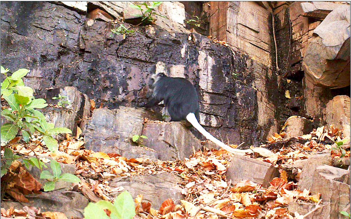
Figure 6. King Colobus Colobus polykomos in Sabé (Guinea). Camera traps (Bushnell, model 119445).

Badiar Biosphere Reserve, and is adjacent to the Dindéfelo Community Nature Reserve, in southern Senegal. Mammal communities in these protected areas have been inventoried extensively, but no records of C. polykomos have been reported (Dupuy 1971; Adie et al. 1996; Aransay 2010). The population in Lebekere might be isolated from the main distribution of the species. Nevertheless, we cannot rule out the existence of intermediate populations in northern and central Guinea. The closest known population in Guinea-Bissau is that of the Boé region (Gippolitti & Dell’Omo 2003; Guillherme 2014), but it is separated from Lebekere by c. 175 km. We recommend further studies on the Fouta Djallon mountain massif, with special emphasis on the eastern sector, towards the basin of the Gambia River, to obtain better knowledge of the northern limits of their distribution. Confirmation of the presence or absence of intermediate populations, connecting Lebekere and those in the rest of Guinea, would facilitate a more informed assessment of the conservation status of the species.