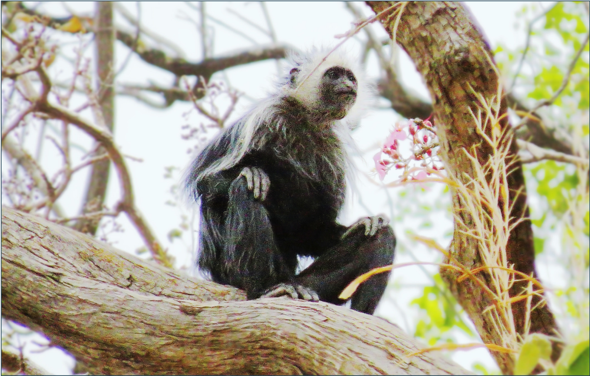
Figure 3. King Colobus Colobus polykomos in Sabé (Guinea).

These animals were identified as C. polykomos based on their distinguishing morphological characteristics: pure white and long, non-tufted tail (approximately 90 cm long); long hair with silver tonalities over the head; and large and white epaulettes (Groves & Ting 2013; Figures 3, 4, & 5). In addition, images of C. polykomos were obtained with camera traps placed on the ground at a waterhole on April 17th 2013 (Figure 6). A total of 29 sightings were recorded inside the forest patches with the tallest trees and more mature structure. The number of individuals per group ranged from 2 to 15 (mean = 6.9; S.D. = 4.5). In 27.5% of the sightings, the colobus monkeys were observed descending from the canopy and walking on the ground while they performed their daily activities.