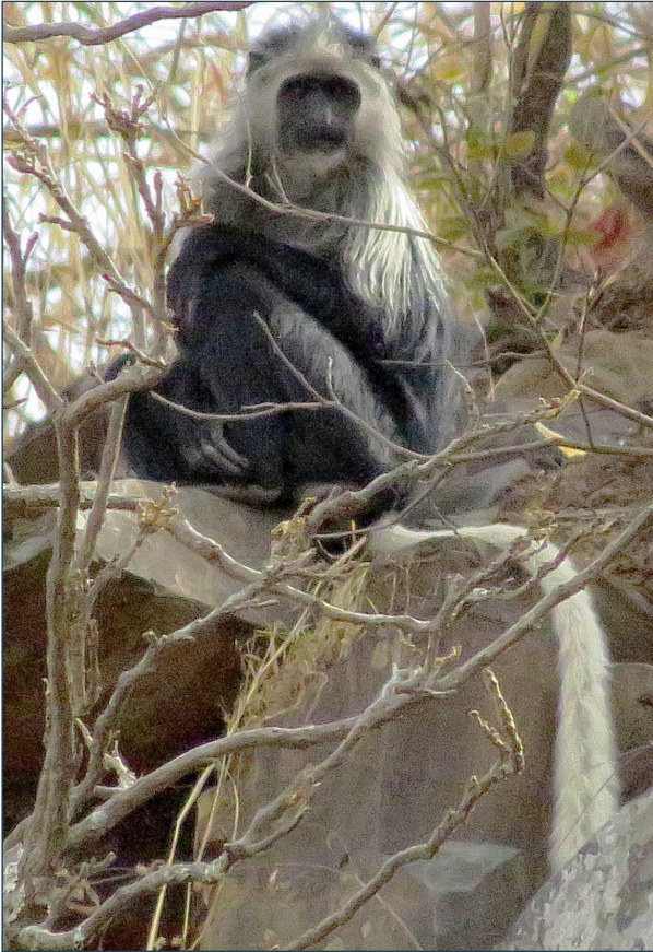
Figure 5. King Colobus Colobus polykomos in Sabé (Guinea).

Badiar Biosphere Reserve, and is adjacent to the Dindéfelo Community Nature Reserve, in southern Senegal. Mammal communities in these protected areas have been inventoried extensively, but no records of C. polykomos have been reported (Dupuy 1971; Adie et al. 1996; Aransay 2010). The population in Lebekere might be isolated from the main distribution of the species. Nevertheless, we cannot rule out the existence of intermediate populations in northern and central Guinea. The closest known population in Guinea-Bissau is that of the Boé region (Gippolitti & Dell’Omo 2003; Guillherme 2014), but it is separated from Lebekere by c. 175 km. We recommend further studies on the Fouta Djallon mountain massif, with special emphasis on the eastern sector, towards the basin of the Gambia River, to obtain better knowledge of the northern limits of their distribution. Confirmation of the presence or absence of intermediate populations, connecting Lebekere and those in the rest of Guinea, would facilitate a more informed assessment of the conservation status of the species.