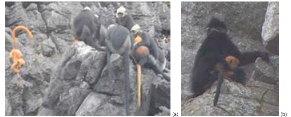
Fig.9. A Cat Ba langur infant (left, 99-102 days old) and juvenile (right, 264-295 days old) (a). A François' langur newborn, less than 20 days old (b). Note the very different patterns of tail colouration.

Cat Ba and François langurs differed in several aspects of developmental timing. François' langurs are born with black hairs on their tail, while Cat Ba langurs have a completely orange tail. In the first month, three-quarters of François' langur tails are black (Fig. 9b), whereas the tail does not start to darken for Cat Ba langurs until the third month, and faded orange colouration remains on the tail into the juvenile stage (12+ months) (Fig. 9a). Reports of Cat Ba langurs in captivity indicate that one year old juveniles have orange-brown on just over half of their tails, and the tail does not really begin to darken until six months of age (Nadler & Ha Thang Long 2000). In contrast, a captive Delacour langur infant of two weeks of age had a predominantly black tail (Nadler 1997; Agmen 2014).