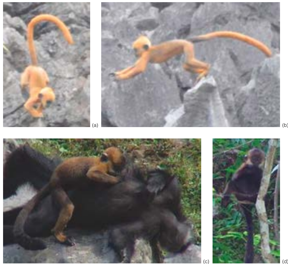
Fig.5. Young Cat Ba langur 99-102 (a) and 119-122 (b) days since birth. Infant François' langurs at 97 (c) and 115 (d) days old. Note the drastic difference between the dark coat of François' langurs and the slowly-transitioning coat of the Cat Ba langur.

From months five to eight (days 121-240), both langurs develop adult-coloured black skin. Among Cat Ba langurs, the back has shifted from an orange coat with a dark undercoat to being a dark coat with a slight orange tinge (Fig. 6a,b); there is a small orange spot between the shoulder blades. The neck and shoulders are still pale orange, as are the limbs (upper legs and lower arms are darker than lower legs and upper arms) and lower tail (by the end of this period only the lower third of the tail is orange, and the underside remains darker than the top). The blanched thigh patches of females and the saddle become more visible (Fig. 6a). It is at this stage that Cat Ba langurs gain the larger abdomen characteristic of leaf-eaters. François' langurs continue to have pelage darkening (albeit yellow hair is still visible on the head and crest), a whitening of the moustache, and a more pointed crest (Fig. 6c,d).