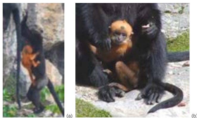
Fig.3. Infant Cat Ba langur at 41-44 days of age (a). A 60-day-old François' langur (b). Note darkened skin in both species.

In the second month (days 31-60), the face, ears, hands, and feet darken in both species (Fig. 3). Among Cat Ba langurs, the crest continues to darken, and although the orange natal coat is dulled (especially on the limbs), black hairs are not yet visible (Fig. 3a). Among François' langurs, black hairs appear on the torso, arms, and upper legs, and the beginnings of a yellowish-white moustache spread from both ears towards the mouth, and black hairs begin to form above the forehead (Fig. 3b).