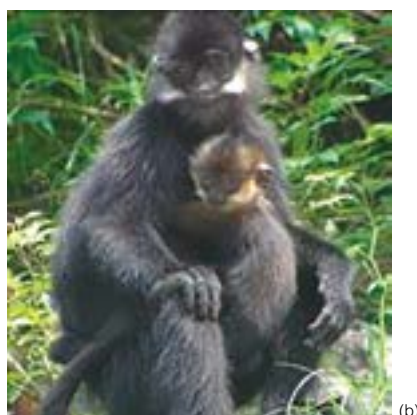
Fig.1. Adult Cat Ba (a) and François' (b) langurs with young attached.