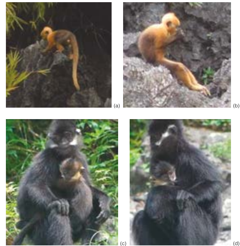
Fig.6. Young Cat Ba langur 168-199 (a) and 180-211 (b) days since birth. François' langurs at 130 (c) and 146 (d) days old.

From months five to eight (days 121-240), both langurs develop adult-coloured black skin. Among Cat Ba langurs, the back has shifted from an orange coat with a dark undercoat to being a dark coat with a slight orange tinge (Fig. 6a,b); there is a small orange spot between the shoulder blades. The neck and shoulders are still pale orange, as are the limbs (upper legs and lower arms are darker than lower legs and upper arms) and lower tail (by the end of this period only the lower third of the tail is orange, and the underside remains darker than the top). The blanched thigh patches of females and the saddle become more visible (Fig. 6a). It is at this stage that Cat Ba langurs gain the larger abdomen characteristic of leaf-eaters. François' langurs continue to have pelage darkening (albeit yellow hair is still visible on the head and crest), a whitening of the moustache, and a more pointed crest (Fig. 6c,d).