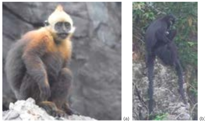
Fig.8. Cat Ba juveniles over one year old (birthdate unknown) (a). François' langur at 13-14 months of age (b). Note the lighter pelage colouration of Cat Ba langurs in contrast to François' langurs.

Animals one to three years old (over 330 days old) are juveniles (based on their foraging and locomotor independence) in both langur species. Among Cat Ba langurs, colouration is also similar to adults and subadults, except that the orange colours on their head and neck are brighter and their torso, limbs, and skin are a duller black (more of a faded orange-brown, especially on the front of the torso and the lower legs, with small spots of pale yellow e.g. between the shoulder blades and on the tops of the wrists and feet) (Fig. 8a). A dark-tipped crest and light-grey saddle are easily visible, the tail retains some pale orange colouration, and the underside is still darker than the top. A fully distended stomach is visible in juveniles (Fig. 8a). Among François' langurs, the moustache narrows and becomes whiter during this stage; colouration is similar to adults (Fig. 8b).