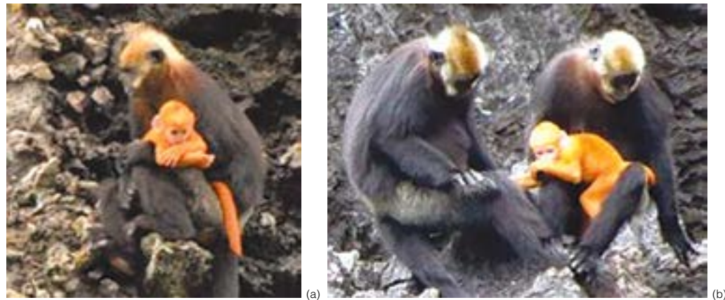
Fig.2. A newborn Cat Ba langur 3-6 days after birth (a), a 15-18 day-old (b) and 24-35 day-old (c) Cat Ba langur infant. A 13-15 day-old François' langur (d). Note the pink exposed skin and bright orange coat at birth; the skin darkens in two-week-old François' langurs, while Cat Ba langurs retain more of the natal coat throughout the first month.

In the second month (days 31-60), the face, ears, hands, and feet darken in both species (Fig. 3). Among Cat Ba langurs, the crest continues to darken, and although the orange natal coat is dulled (especially on the limbs), black hairs are not yet visible (Fig. 3a). Among François' langurs, black hairs appear on the torso, arms, and upper legs, and the beginnings of a yellowish-white moustache spread from both ears towards the mouth, and black hairs begin to form above the forehead (Fig. 3b).