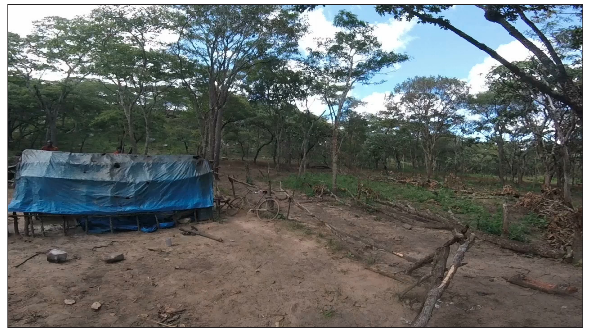
Figure 4. Abandoned corral by Tanzanian herders.

also increase their perceived risk (Hoare 2019). Charred landscapes increase exposure of animals to predation (Figure 1) and so chimpanzees may perceive greater risk given the lack of vegetation to conceal their presence, especially since the cattle are frequently accompanied by people and domestic dogs (see above).