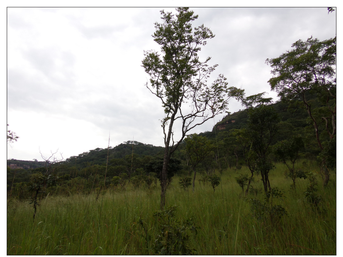
Figure 2. Wet season landscape with tall grass.