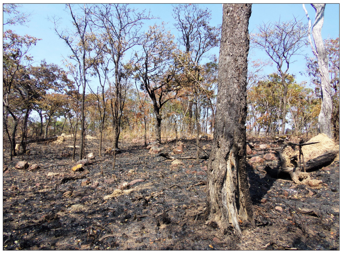
Figure 1. Charred landscape after the annual fires.