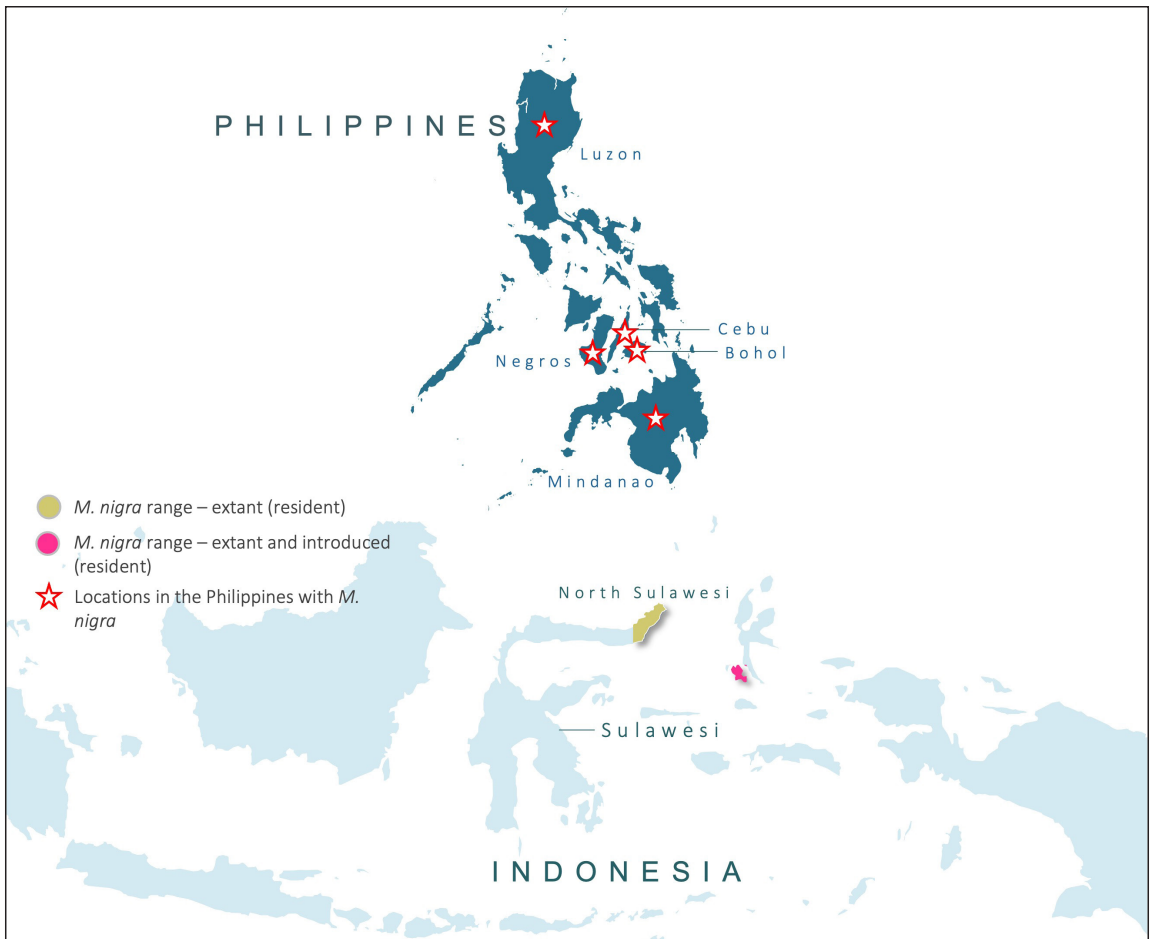
Fig. 1. M. nigra is a Critically Endangered species with a restricted range in Indonesia. Though no import records exist in the CITES Trade Database, at least 36 individuals were recorded in the Philippines through surveys of publicly accessible wildlife facilities (zoos, wildlife collections, places of entertainment) throughout the country in 2020/2021

Hornbill Rhyticeros plicatus (Forster). The native species included six Long-tailed Macaques Macaca fascicularis (Raffles), four Brahminy Kites Haliastur indus (Boddaert), one Philippine Serpent-eagle Spilornis holospilus (Vigors), and one Philippine Deer Rusa marianna (Desmarest). Under the Wildlife Resources Conservation and Protection Act of 2001/Republic Act No. 9147, all terrestrial wildlife (native and non-native) are prohibited from being kept, transported, traded, etc., without a valid permit from the DENR.