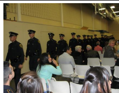
Houston Police Department's Commencement Exercises for Houston Police Academy Cadet Class 217 held on December 19th, 2013, is the first graduating cadet class to be attired in the new HPD uniform.