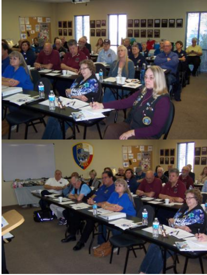
Angleton Pictures Above Good Crowd

Pictures below courtesy of Phil Niehoff, Humble/Houston