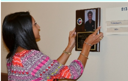
Granddaughter hanging plaque