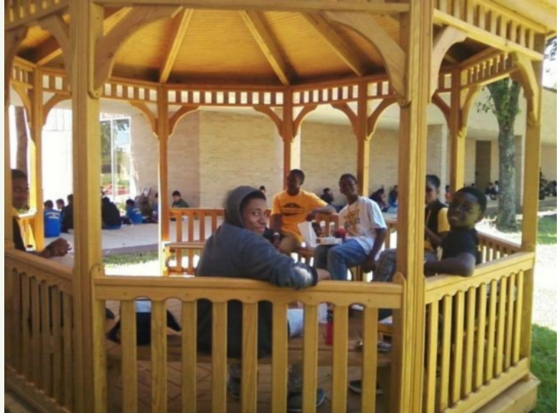
Area school children made good use of the gazebo donated to the HPD Academy by the HCPAAA.