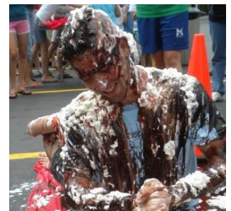
The Human Sundae

Grades 7-12 Sunday-Thursday 7:00 PM to 9:00 PM Cost: $10 per teen (make all 5 sessions and get free tickets and transportation to Great America)