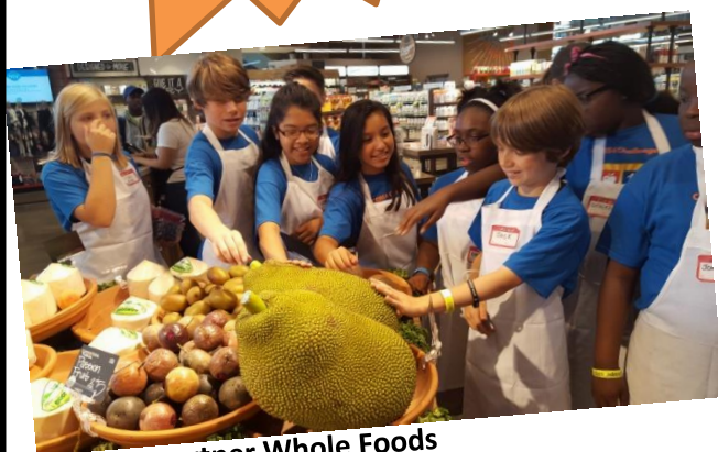
At our partner Whole Foods

At the Irish American Heritage Center in Chicago 4626 N. Knox (@Wilson)