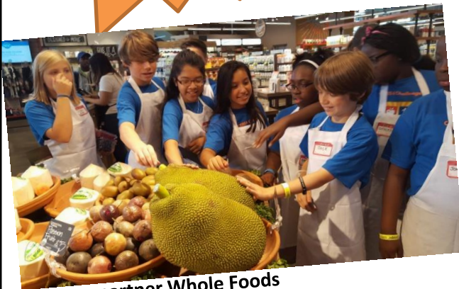
At our partner Whole Foods

At the Irish American Heritage Center in Chicago 4626 N. Knox (@Wilson)