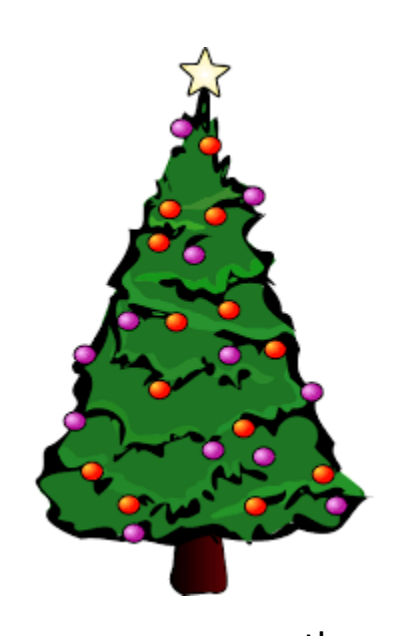
Friday, December 8<sup>th -</sup> 7:00 pm School Cafeteria