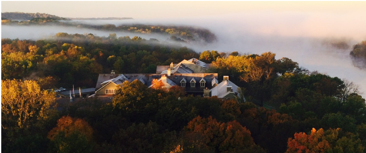
Eagle Ridge Resort

UP IN THE CLOUDS A homesite peeks above the fog and the golf courses at Eagle Ridge.