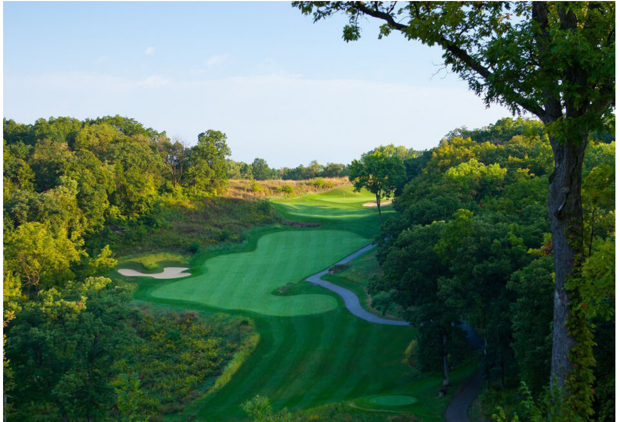
Eagle Ridge Resort

Even as mining made Galena a boom town, the area's raw beauty and proximity to rail service and the Mississippi River made it an attractive vacation by the 1850s. When Ulysses S. Grant returned to visit Galena (where he'd run a leather