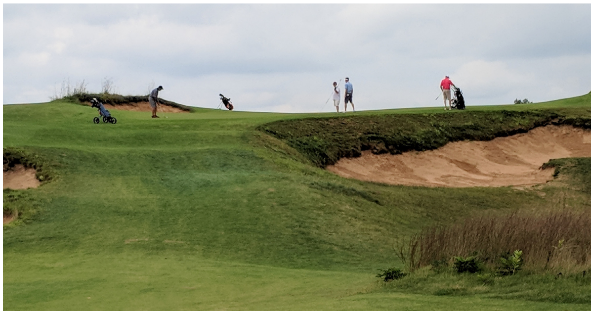
Joy Sarver / LenZiehmOnGolf.com

Lots of American golf destinations offer a variety of courses, and we've been blessed to