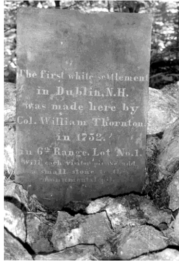
Original settlement marker