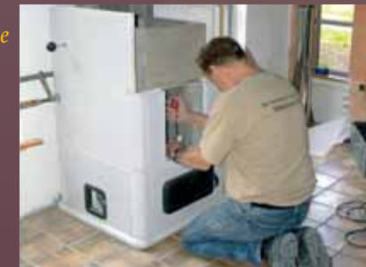
The easy-to-assemble Tigchel heater.