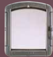
There are 2 types of Tigchel heater doors.