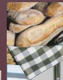
A optional Baking oven.