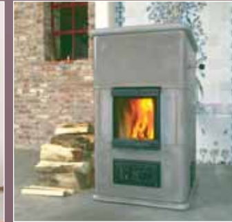
A Tigchel heater 4D (Mouse gray).