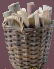
This small basket of wood will keep you warm for 12 hours!

Such constant heat from a Tigchel heater , slowly released as required by the user, is an excellent addition to the modern, insulated home. Once the heater has been fired up, the role of any available central heating gas boiler will be reduced to just providing some extra heat. All you need to do is briefly fire the heater once a day (or twice, in the middle of winter) with a good amount of wood. That's all there is to it! The heater takes only half or even as little as a quarter of the wood that other woodburners need. Thanks to the special combustion system in