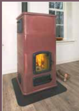
The Tigchel heaters 4D (Beige) and 6D (Brick red), in a central position.

Not only does radiant heat provide very pleasant sensations, but users are even more enthusiastic about the user-friendliness of the Tigchel heater . In the past, people had to add wood and keep an eye on the woodburner all the time. In contrast, the Tigchel heater works on the principle of an accumulator: storing heat, and releasing it in a controlled manner. A heater made of this material releases the heat little-by-little for a very long time. At last, a woodburner that looks after itself all day long!