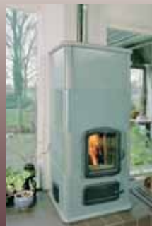
Tigchel heater 6-D 150cm. Almond green.