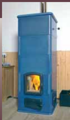
Tigchel heater 8-D 185cm. Blue.