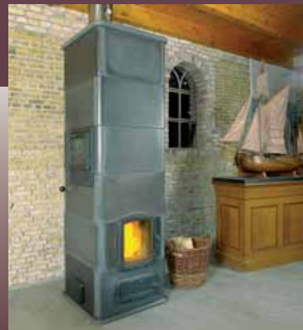
Tigchel heater 10-D 220cm Antracite (with baking oven).