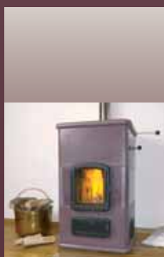
Tigchel heater 4-D 115cm. Purple.