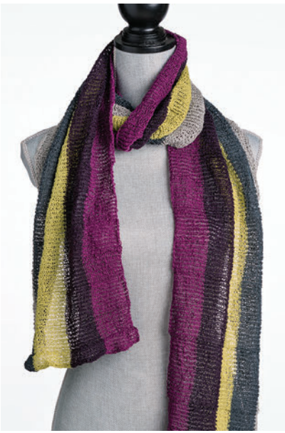
Kaarst, p 5