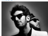
Quickie Q&A: Chromeo