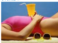
Gulf Coast Summer Guide