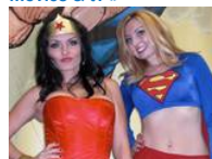
Hotties of Comic-Con 2011