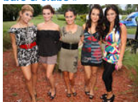
Flashed: The Edison