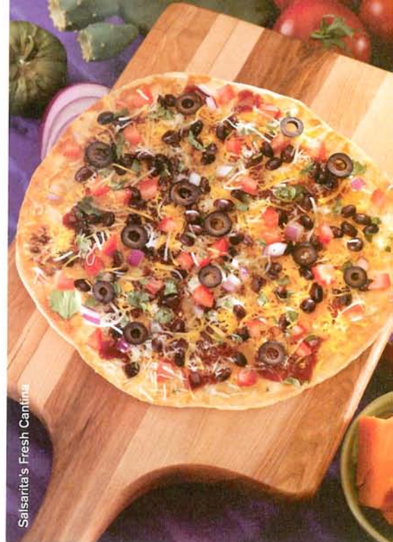
Salsarita's Fresh Cantina