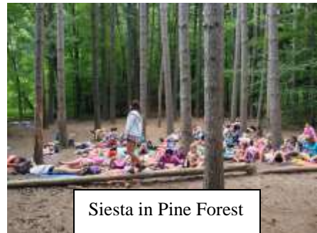
Siesta in Pine Forest

With an energetic and tireless staff, the DC program was a major success this summer. The program had completely full enrollment throughout the summer. The counselors and staff members rallied behind their new group symbols and "made amazing memories for campers and carried on Minikani's tradition of excellence." The directors coordinated with the kitchen, maintenance, and year-round staff to ensure the summer ran as smoothly as possible.