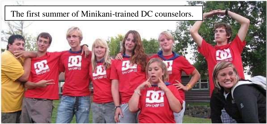
The first summer of Minikani-trained DC counselors.

It was a brief rest period every Thursday in Pine Forest. These gave the campers and staff some much needed rest after the previous night's sleepover.