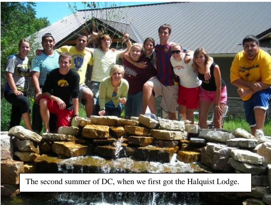
The second summer of DC, when we first got the Halquist Lodge.

With the DC coming into its own, it has allowed Minikani as a whole to restructure things. The summer staff members are now hired as a summer counselor. There is no more divide between day and resident camp. Beginning with the O/LT3s in 2008, each 3 spends time in day camp and resident camp. The allowed all first year counselors to begin the transition between Day Camp, resident camp, and MiniKamp the following summer. This “one staff” mentality is now engrained in the