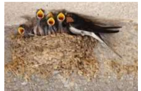
Barn Swallow with hungry babies:

Bank Swallows are smaller than the other swallows. As their name suggests, they prefer to nest in colonies in tunnels in vertical banks of dirt or sand, usually along rivers or ponds, seldom far away from water. Years ago when the sea wall was built along Amy Belle they put in 5 inch pipes to help the water drain through the dirt into the lake. Bank swallows from the surrounding sand and gravel pits must have been delighted to see such perfect nesting sites. Today you can still see swallows flying low over the lake with quick, fluttery wingbeats in search of insects.