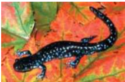
Blue Spotted Salamander

You say you’ve never seen a salamander at camp? I’m not surprised. They are generally nocturnal and prefer to spend their days under rocks or logs in moist areas. As amphibians, they must rely on their moist skin for breathing, due to poorly developed lungs. If you’ve seen one at camp, it was probably when you were hunting wood for a fire, or moving rocks for a cabin beautification project. Minikani’s most common salamanders are the blue-spotted salamander and the spotted salamanders.